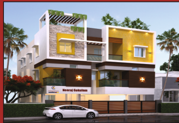
NEERAJ GOKULAM #25/34, 11th Street, North Jeganatha Street Villivakkam, Chennai - 600 049.