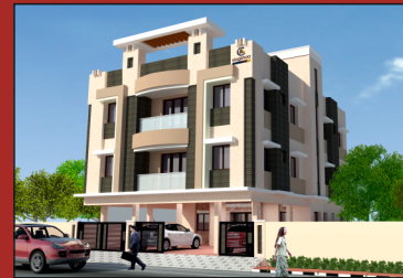
NANDAKESHAV OPTIMUS Rajiv Gandhi Nagar, Kolathur, Chennai-600 099.