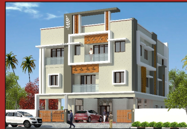
JAGADISHA ORTUS Sriraman Salai, Thanikachalam Nagar, Madhavaram, Chennai 600051.