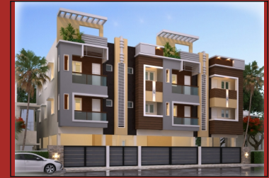
VIHAV GURU KRUPA Dee Gee Nagar, Soorapattu, Chennai-53